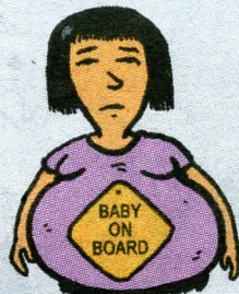
FULLY-GROWN WOMAN: EXPENDABLE FETUS-MOBILE!

BUT IF PREGNANT WOMEN DON'T COUNT AMONG THE LIVING... TECHNICALLY THAT MAKES THEM THE UNDEAD.